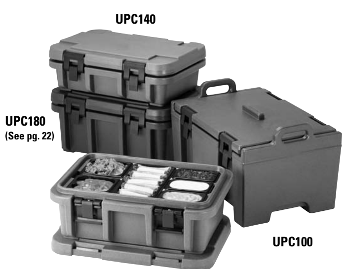
UPC160 (See pg. 22) (Shown with 2 each 1/6, 1 each 1/3, and 3 each 1/9 GN Size Food Pans plus 2 each DIV12 Divider Bars.)